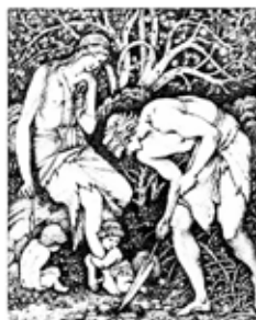
When Adam drove and Eve span Who was then the gentleman