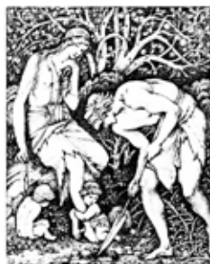
When Adam drove and Eve span Who was then the gentleman